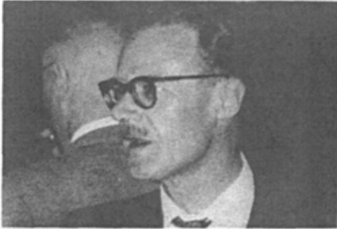
Fig. 13. Frank Parsons from Leeds, UK presented the first Registry report on transplantation in 1965.