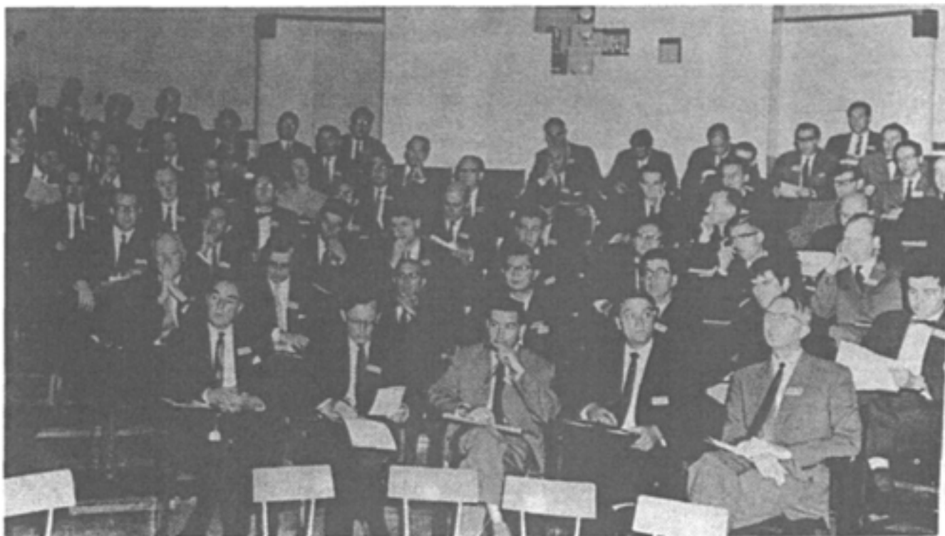
Fig. 5. Participants in the first EDTA congress at Amsterdam (1964).

interest of the association who were working in Europe and adjacent territories.