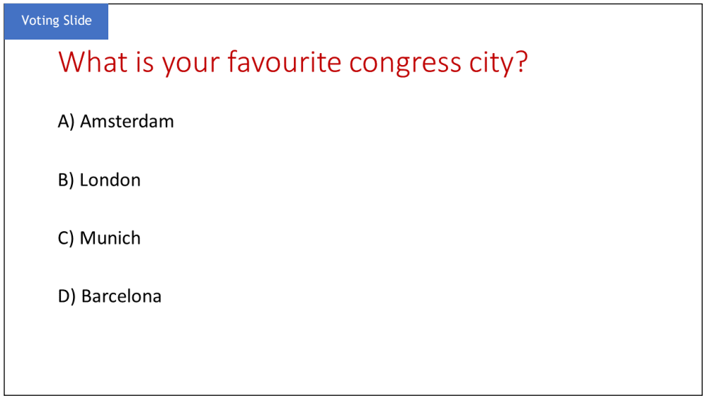
2: Screen display of the active voting, start the voting by clicking on "Start voting".